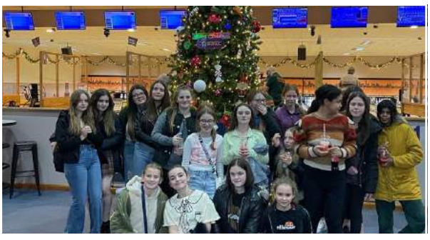
30 members of our netball extra curricular club were rewarded for their attendance and participation this term with a well-deserved trip to the bowling alley followed by pizza!