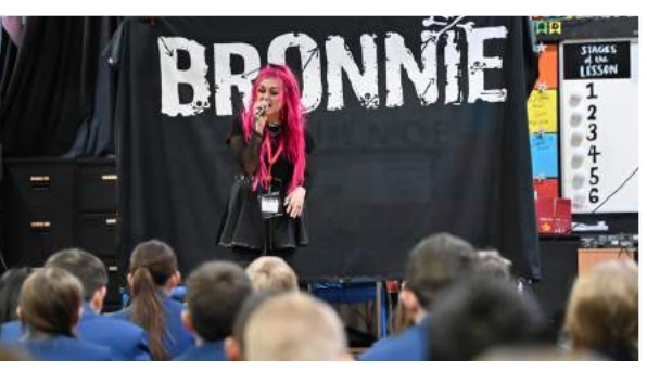
Our Year 7 students were treated to amazing performances from Bronnie, along with key messages around mental health and well-being, equality, body image, and anti-bullying.