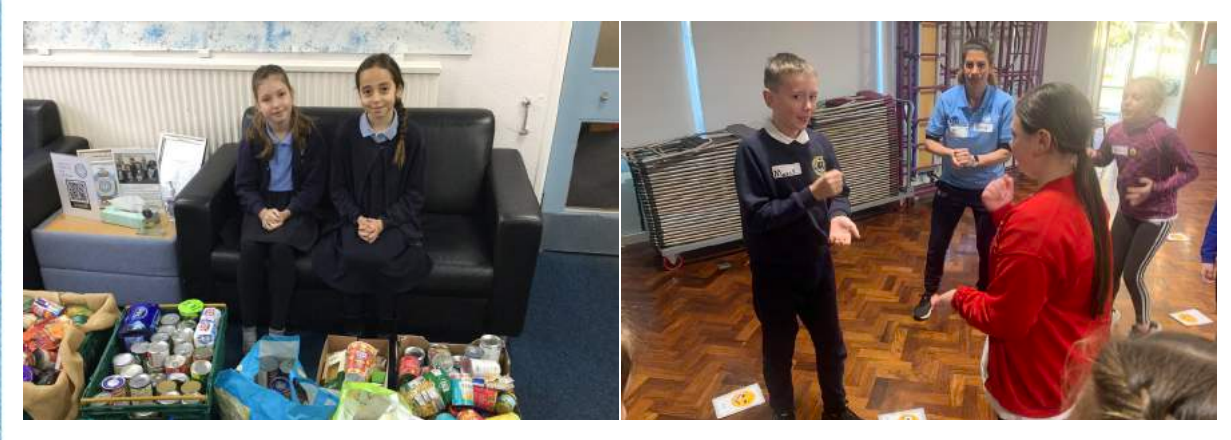
Our Ministers for Charity were proud to hand over our food bank donations to our Parish.