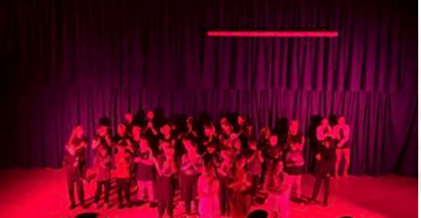
Wow!!! What an evening of dance. Our dance teachers are extremely proud of every student who performed in this year's Dance Show.