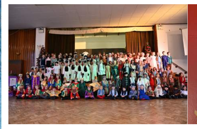
We had a great time filming our nativity this week! Our children have impressed us, as always, with their great performances. Details about how to see the performance will be released soon.