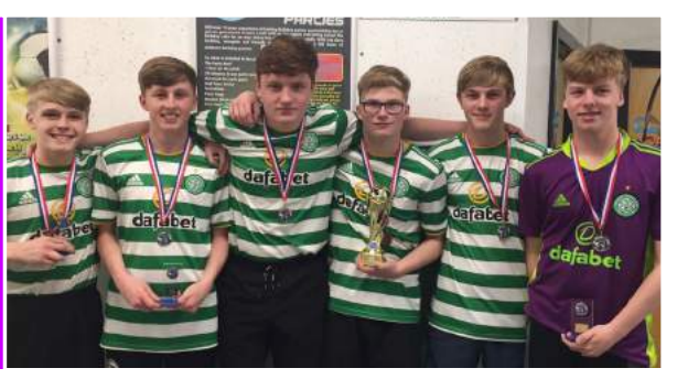
Well done to our Year 13 students who recently won their 5-a-side league at the soccer dome. Three of the team also won individual awards for: top goal scorer, golden gloves and man of the match!