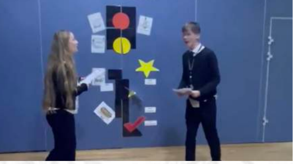
Rehearsals for our school production of Little Shop of Horrors are well underway and it's looking great! Keep your eyes peeled for information about how to get a ticket - you won't want to miss this!