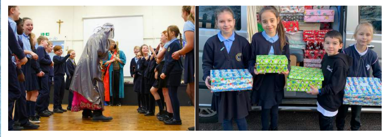
Teams 3, 4 and 5 were lucky enough to take part in an Action Transport Theatre workshop. Students had a great morning helping to review a new play.