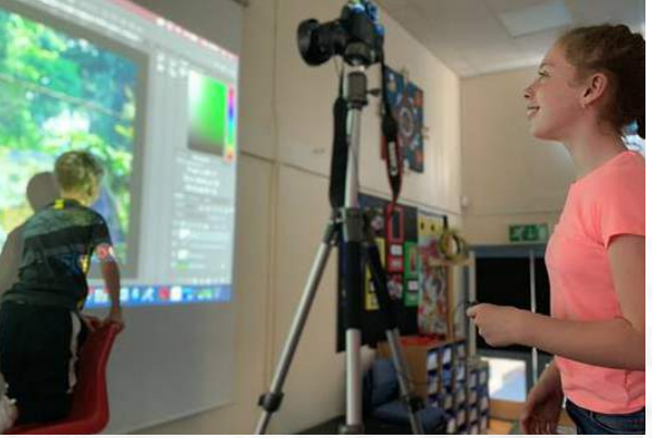
St Bernard's RC Primary School and Holy Family Catholic Multi Academy Trust were chosen to take part in the Creativity Collaboratives project funded by the Arts Council and Freelands Foundation.

Holy Family Catholic Multi Academy Trust