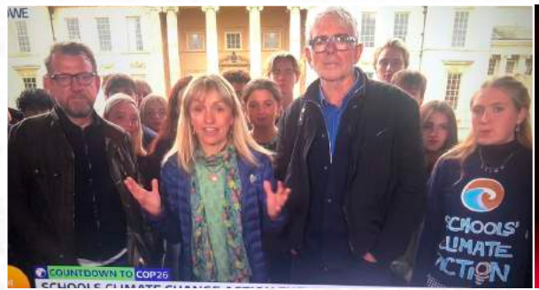
'We need these young minds to fix our planet.' It was great to see students from SMCC with Michaela Strachan on Good Morning Britain during the schools climate action conference.