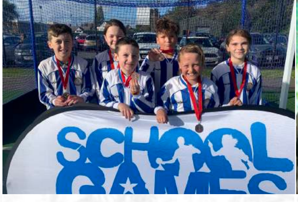
A huge congratulations to our amazing hockey players who came 3rd in the Ellesmere Port School Sport Partnership competition.