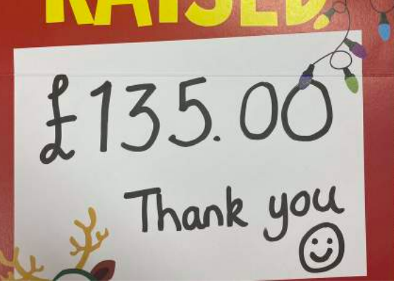
We had a wonderful day wearing our Christmas hats! Thanks to the community's generous donations we raised a total of £135 in for Claire House.