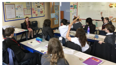
Year 6 held a press conference for their own Greta Thunberg!