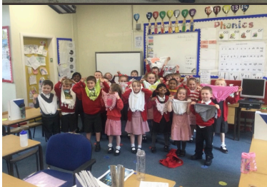
Year 1 worked on their DT skills, recycling old t-shirts into handy (and fashionable!) bags