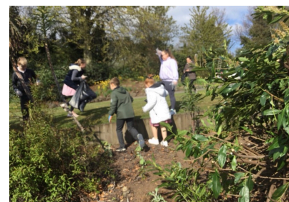
Year 4 took a trip to the Arno to do some litter picking